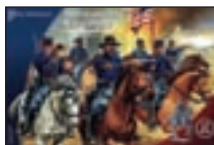
ACW 2 Plastic American Civil War Cavalry £15