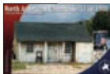
RPB 1 Plastic American Farmhouse £12