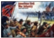
ACW 1 Plastic American Civil War Infantry £15