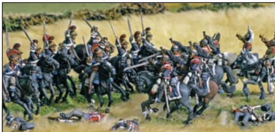
Waterloo – plastic versus metal! Jim Bowen painted the 'Blues', others by various painters.

Full lists available on website or by post