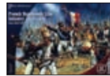
FN 100 Plastic French Napoleonic Infantry £15