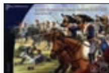
FN 120 Plastic French Napoleonic Cavalry £15